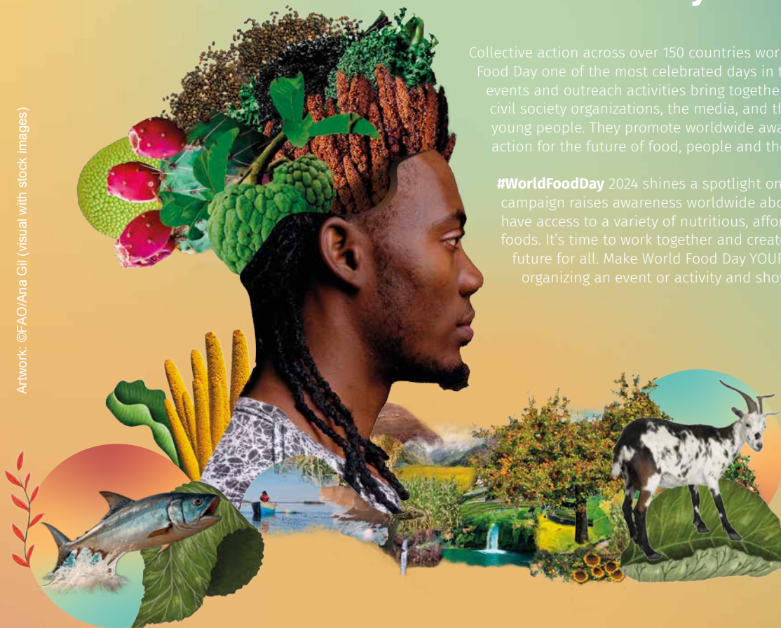
Artwork: ©FAO/Ana Gil (visual with stock images)

#WorldFoodDay 2024 shines a spotlight on food as a human right. The campaign raises awareness worldwide about the need for everyone to have access to a variety of nutritious, affordable, safe, and sustainable foods. It's time to work together and create a better, more sustainable future for all. Make World Food Day YOUR day. Join the call by organizing an event or activity and show how you are taking action.